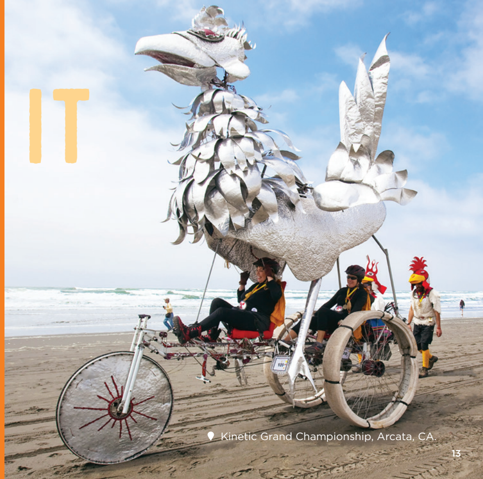
📍 Kinetic Grand Championship, Arcata, CA.

Roll down the streets of San Francisco on a big wheel? Sleep in a giant bird's nest in Big Sur? Enjoy a multi-sensory, 3D-mapping enhanced gourmet meal in Napa? Or just check out the view from a beach towel in Laguna? No matter what comes out of that dream-filled brain of yours, there's one thing you can count on: we're up for it in California. Or to put it more plainly, you doing you has our full support.